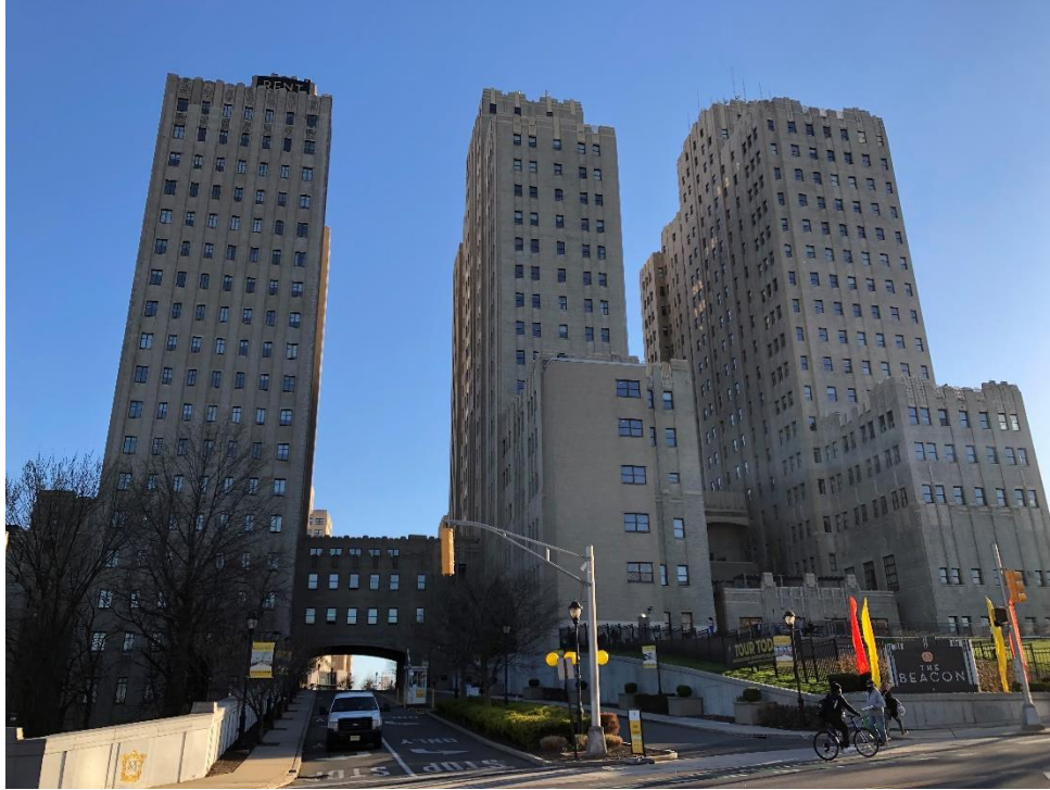
Figure 5: View of The Beacon properties at 4 Baldwin Avenue (Block 13601, Lot 2) adjacent to the west of the subject property, from Montgomery Street viewing south.