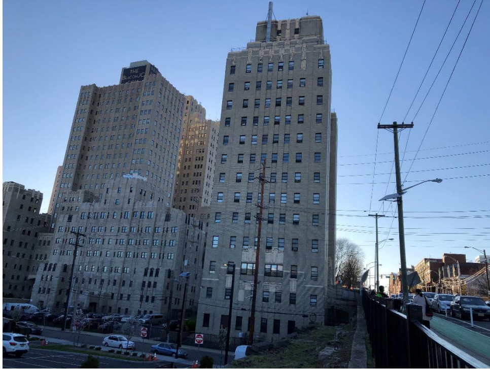
Figure 1: View of the subject property at 591 Montgomery Street (Block 13601, Lot 1), from Montgomery Street viewing west.