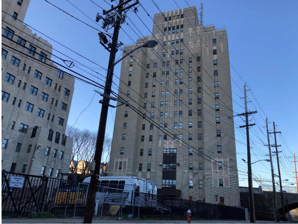
Figure 3: View of the subject property at 591 Montgomery Street (Block 13601, Lot 1), from Cornelison Avenue viewing north.