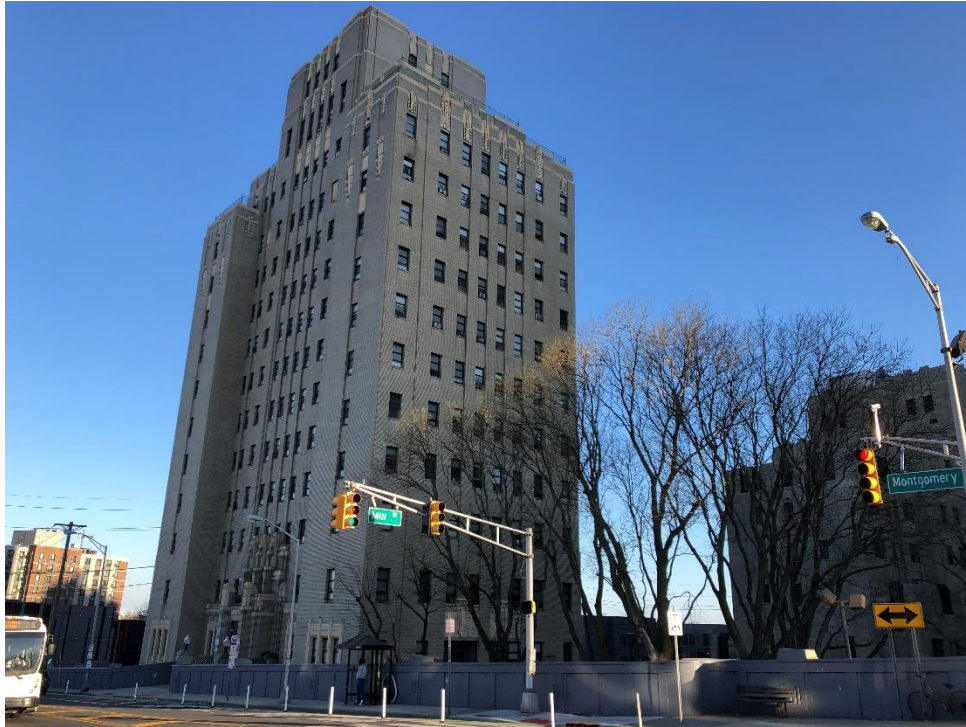
Figure 2: View of the subject property at 591 Montgomery Street (Block 13601, Lot 1), from Montgomery Street viewing southeast.