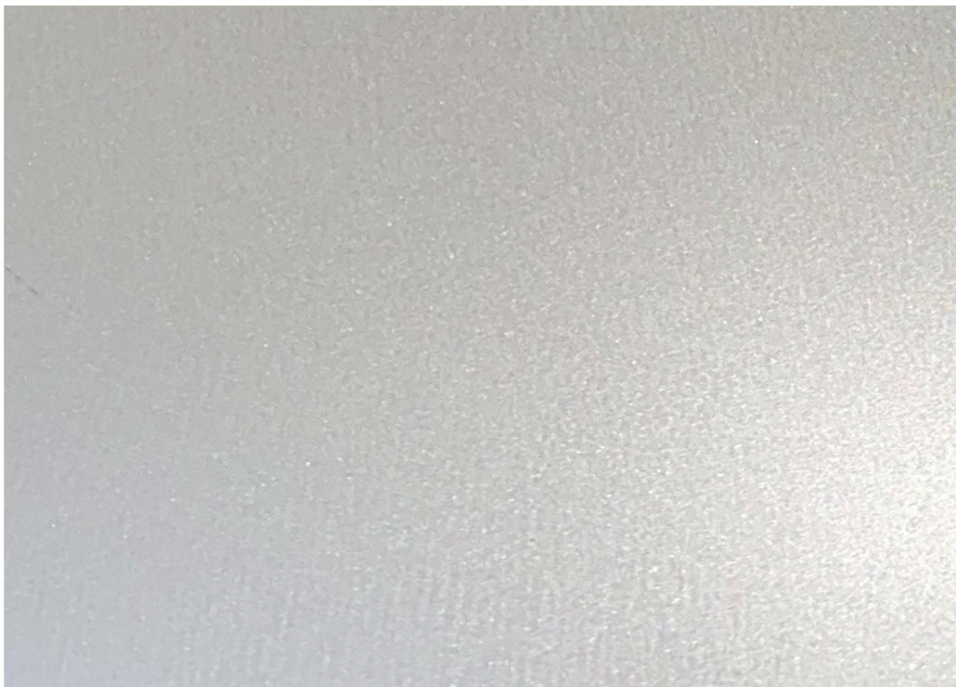
B. Aluminum Composite Panels Omega Panel Champagne