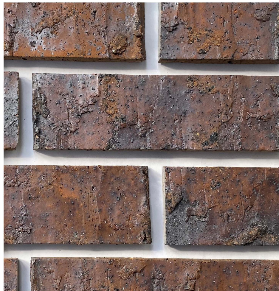
A. Brick Veneer Sioux City Brick Mountain Shadow Tuscan