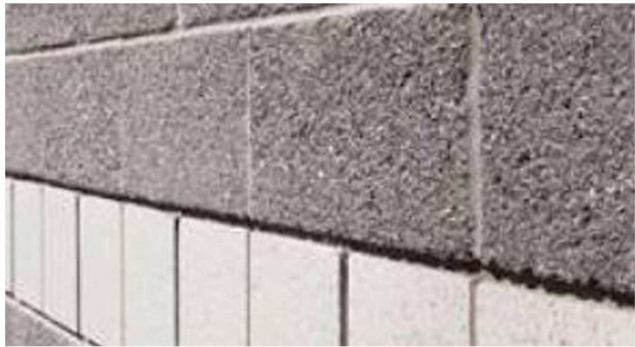
F. Finished Block Trenwyth Masonry Block Rhine Grey Textured