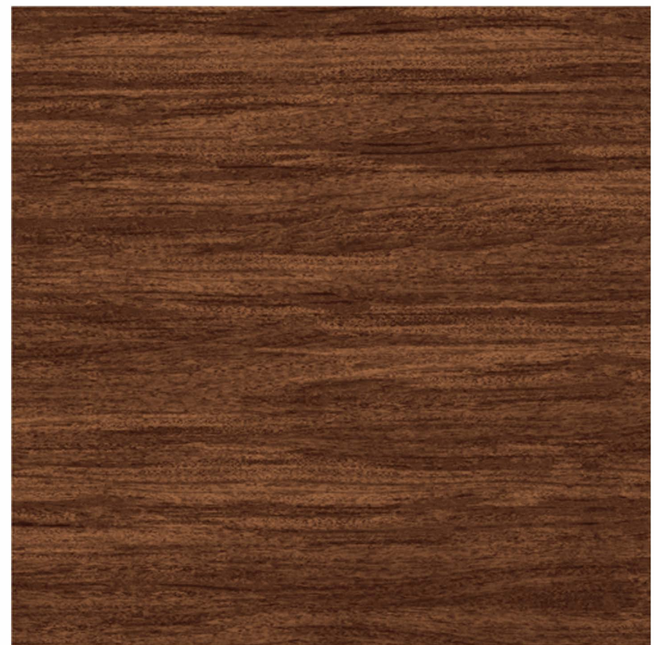
E. Composite Panels Omega Panel Warm Cherry