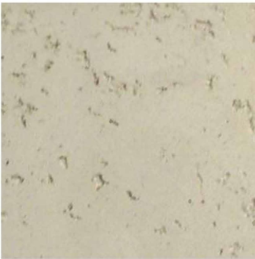
J. Custom Cast Stone Arcustone Limestone Coating