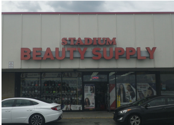
Existing internally illuminated sign 5' x 28' = 140sq.ft.