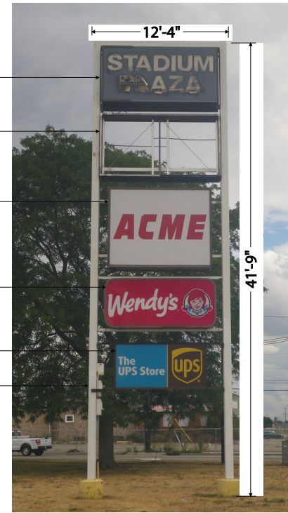
Existing 246sq.ft. pylon sign to be removed