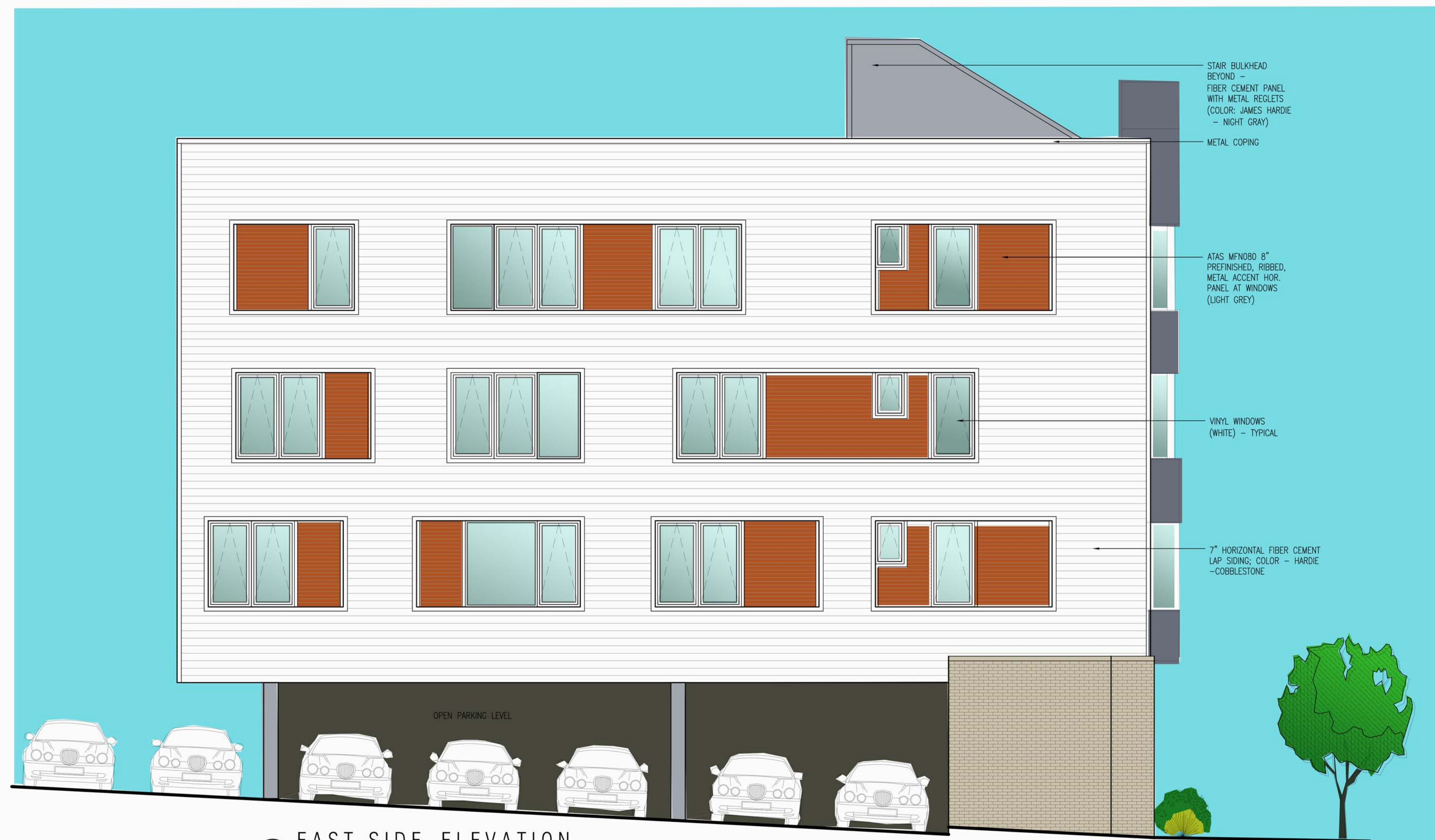
② EAST SIDE ELEVATION SCALE: 3/16" = 1'-0"