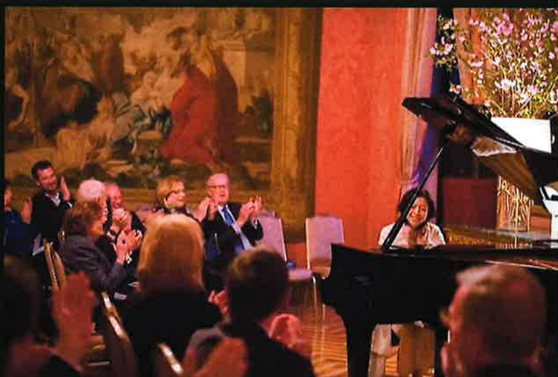
Performing at annual gala at the French Consulate, New York, May 2016