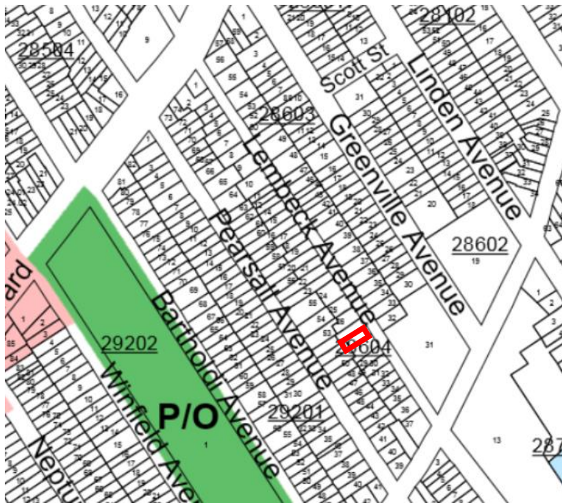
Applicant's Site is outlined in red

1,367 square feet & 370 square feet of roof deck