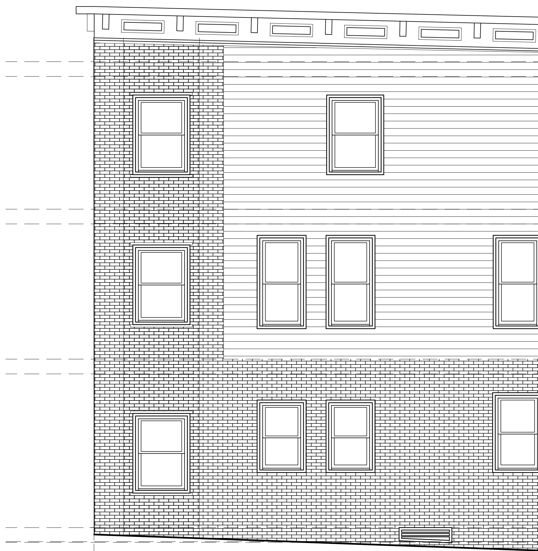
2 PROPOSED ELEVATION SUBMITTED TO THE BOARD