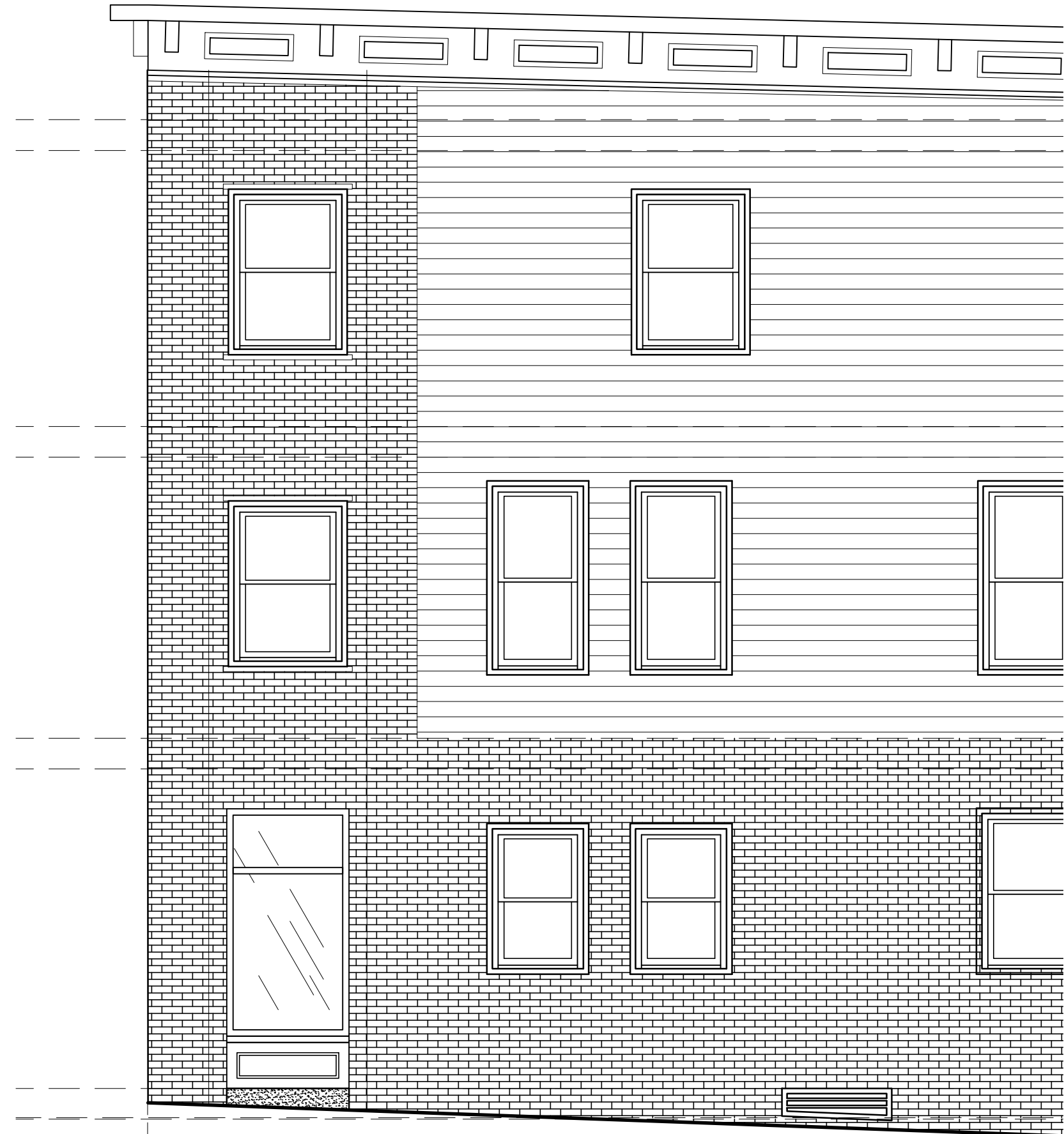
3 PROPOSED ELEVATION WITH A STOREFRONT CHARACTER