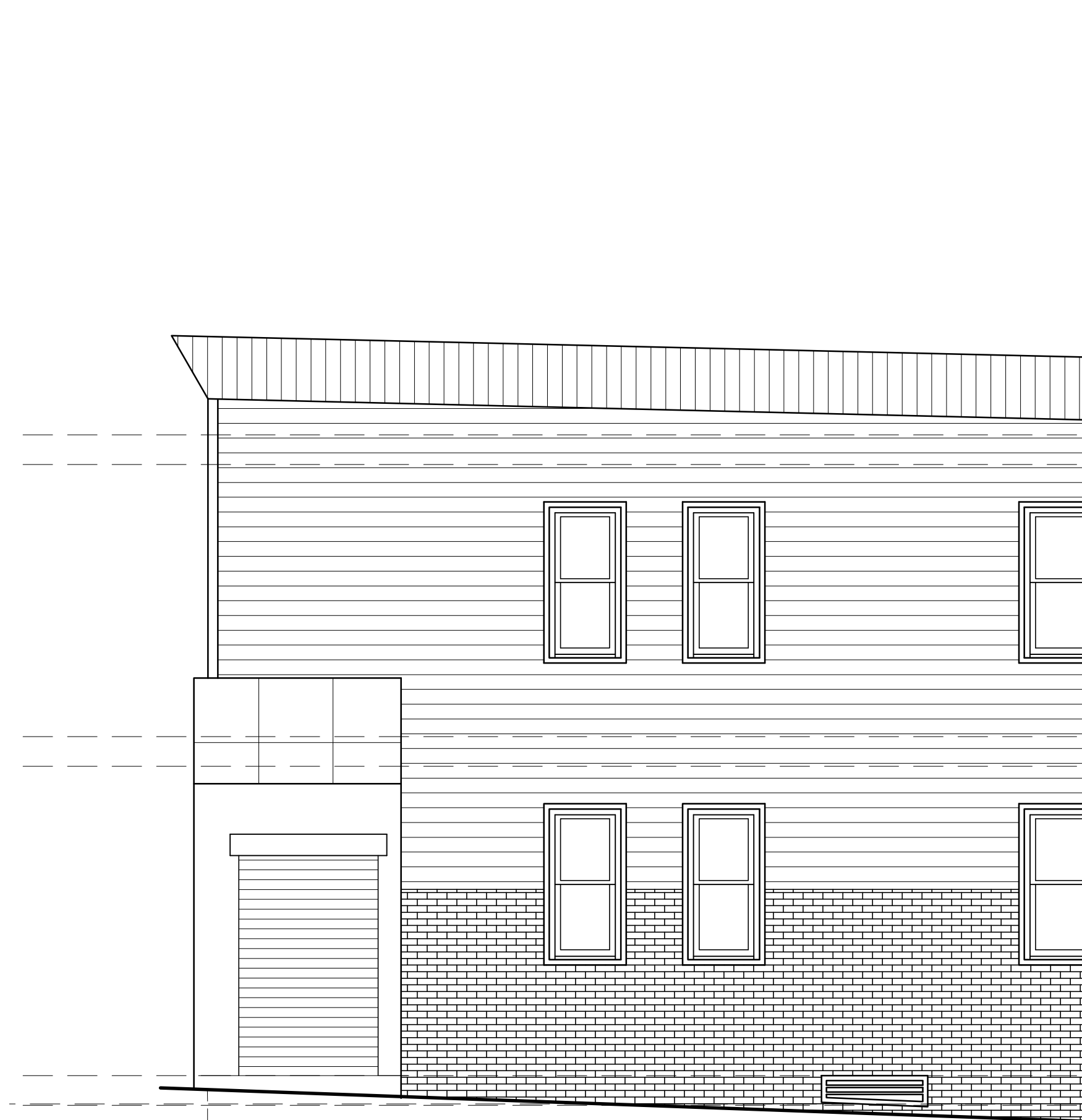
1 EXISTING ELEVATION @ STUYVESANT AVENUE