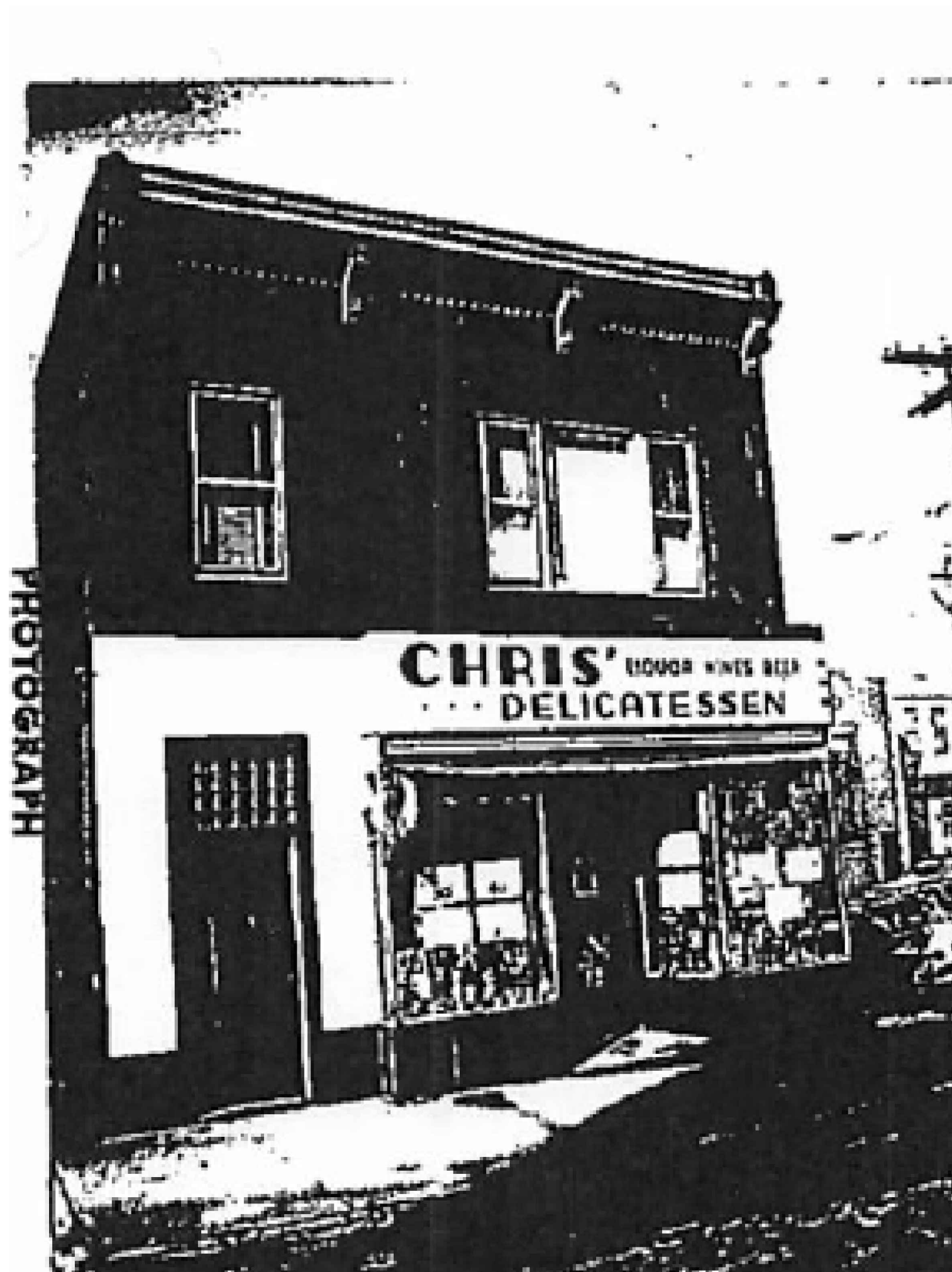
1 TAX RECORD PHOTOGRAPH CIRCA 1938 OF ELEVATION @ WELDON STREET