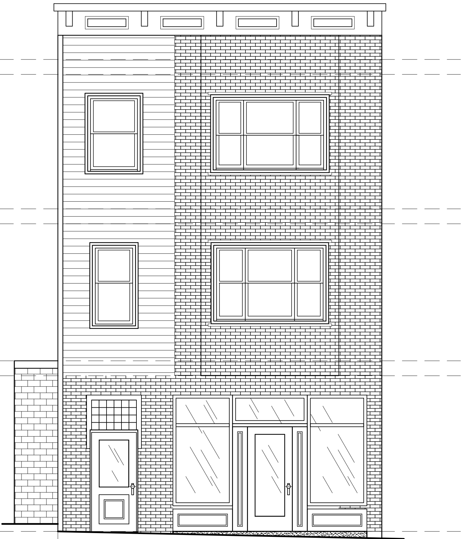
3 PROPOSED ELEVATION WITH A STOREFRONT CHARACTER